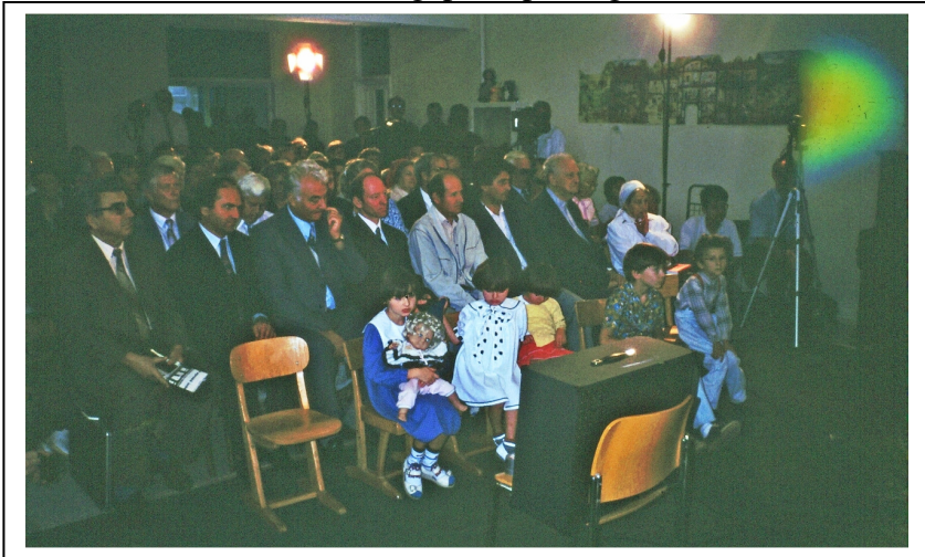
Late Rev. Richard Wurmbrand and wife Sabina at the 1993 opening Of the Agape Orphanage, in Pascani, Romania

Help For Refugees, Inc., PO Box 5161, Torrance, Ca. 90510, USA Pictures received from the Agape Orphanage, Pascani Romania