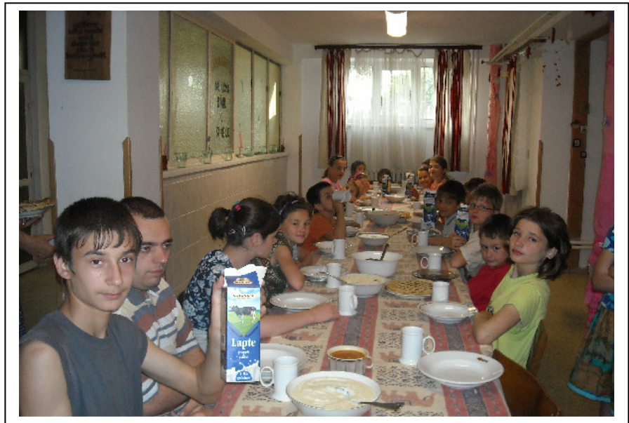
Agape Orphanage, Eating Hall

Father serving a murder sentence, while mother left children behind to go work in Italy.