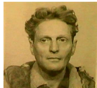
Mug-shot of Late Reverend Richard Wurmbrand when held in the Jilava prison, in communist Romania.