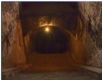
The Communist Jilava Prison. Entrance to the underground cells.

Religious writers who praised Mao, many who praised so called "freedoms in the communist camp," prove now to have made fools of themselves. Only God can make new men out of sinners, when they repent and believe in Christ.