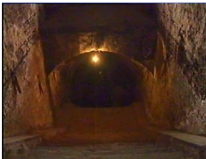
The Communist Jilava Prison. Entrance to the underground cells.

Many theological schools teach Apologetics. Apologetics offer recent archeological, medical, historical and even scientific discoveries arguments, trying to prove some how that certain statements in the Bible are correct. Many try explain how the Ten Plagues over Egypt or the description of the miraculous Parting of the Red Sea could be made more believable, as having taken place. Lord Jesus though says NOT to read the Scripture in the feeble light of archeology or science discoveries, but in the light of the absolute power of God. Even an atheist need concede, man did not create the universe. Once we accept that "In the beginning God created the heaven and the earth" what else would be impossible to God and what description of God's miracles need be made more acceptable by our comments? Every moment we live, is a miracle. Elihu in the Book of Job, puts a stop to the long winded discussions between Job and his friends, by telling them: "If (God) set his heart upon man, if he gather unto himself his spirit and his breath; All flesh shall perish together, and man shall turn again unto dust." (Job 34:15) There is no alternative, no choice to faith in the Power of God.