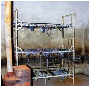
Prison cell with bunk-beds with no mattress, prisoners were obliged to sleep on. Stove for show only, never heated in cold winters.