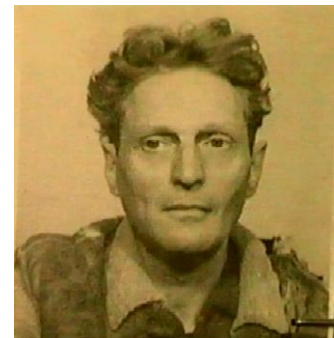
Mug shot of Late Reverend Richard Wurmbrand when held in Jilava.